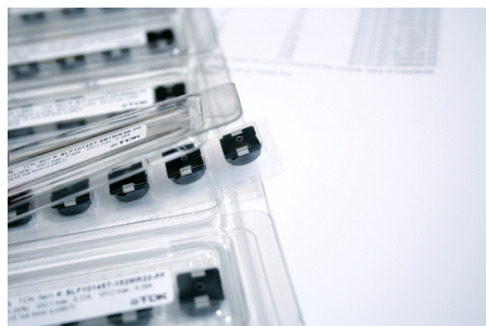
Entnahme / taking out